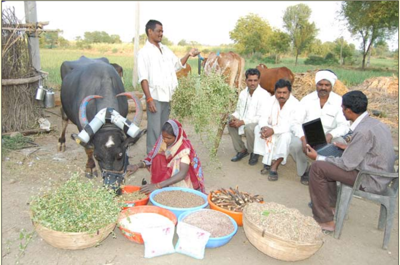
Methane emission reduction through balanced feeding under field conditions