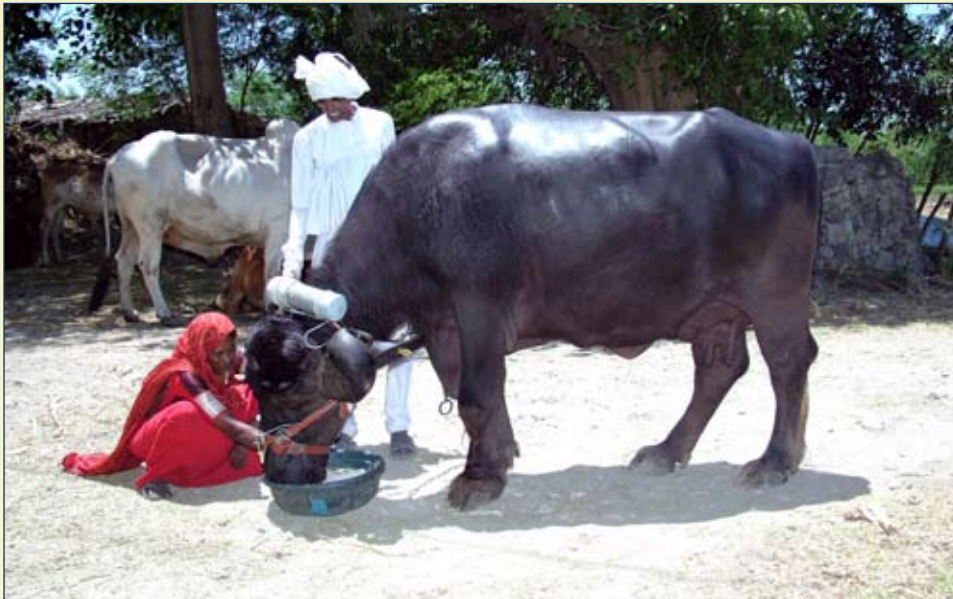
Methane emission estimation by SF 6 tracer technique under field conditions