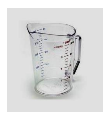
Figure A.5: Calibrated Plastic Jug.

f. Milk recording should be carried out using a transparent calibrated plastic jar with a sensitivity of 100 cc or using an accurate calibrated weighing machine.