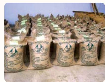
Labelled fodder seed