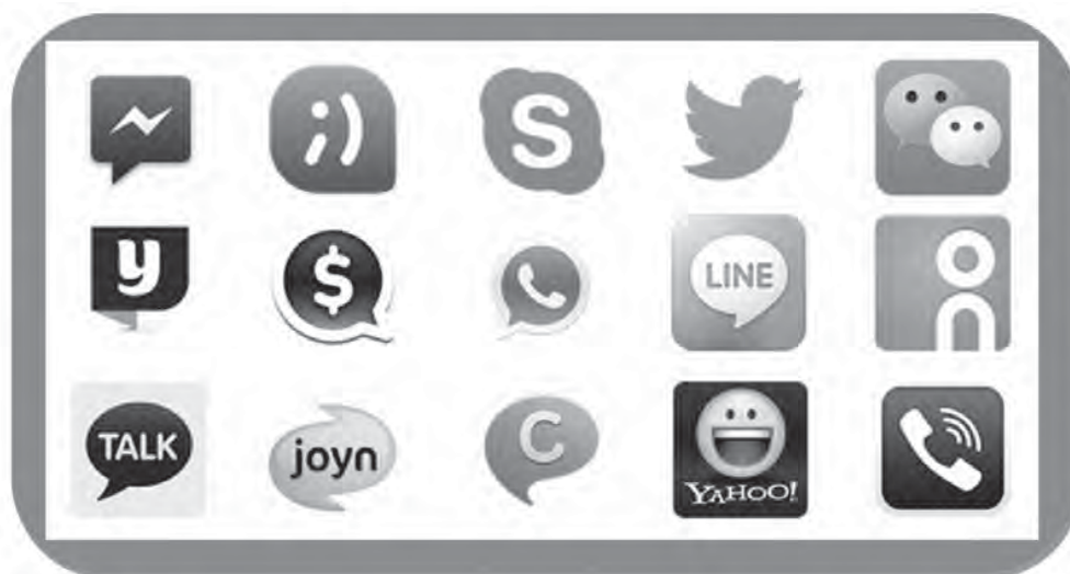
Fig. 2 Instant messages tools