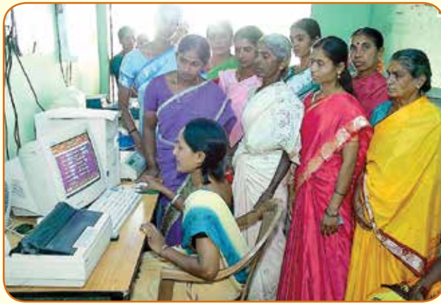
A technical officer explaining the concept of RBP to LRPs