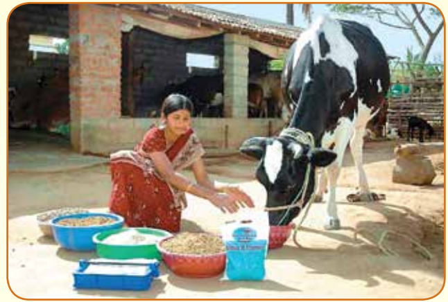
A milk producer feeding balanced ration to her cow

The local resource person (LRP) revisits the milk producer according to his/her requirement and keeps a record of the various observations related to the quality and quantity of milk, including the cost of milk production before and after implementation of the Ration Balancing Programme and increase in the net daily income per animal.