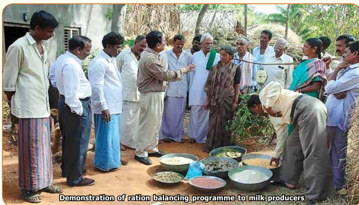
Demonstration of ration balancing programme to milk producers