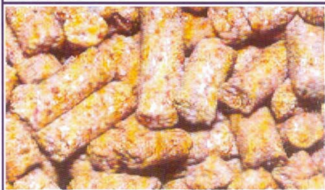
Straw based pellets