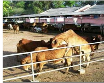
Mounting and chin resting during estrus