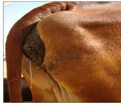
Aggressive behaviour, cervical mucus discharge and swollen vulva during estrus

Buffaloes are shy breeders and many a times the signs of heat are not overt to be detected easily (Silent heat). Incidence of silent heat is high in the herds practicing artificial insemination rather than natural service. Estrus in buffaloes is expressed between the late evenings to early morning, i.e. during the darker part of the day, which further reduce the chances of detection. The most conclusive sign of estrus in buffalo is considered as standing to be mounted by a teaser bull or androgenised female. However, this method can only be practiced in organized large dairy herd. Other signs of classical heat may also be found in buffaloes but with less intensity. The chances of detection of heat in buffaloes can be increased by observing the buffaloes during late evening and early morning for heat signs. The person who is milking the buffaloes can detect the heat most efficiently and accurately.