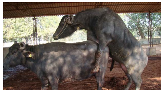
Flehmen reaction, frequent micturition and standing to be mounted behaviour during estrus in buffalo