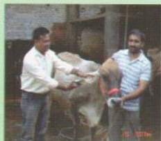
Figure. 2: Ear Tag animal