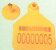
Figure. 1: Ear Tag

The specifications for the ear tag shall be: The male tag as a button shall be with a minimum diameter of 27 mm with a metal point and the flag shaped female tag with a closed head with a minimum size of 55x65 mm. 12 digits are to be printed in two rows of six digits each.