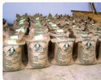
Labelled fodder seed