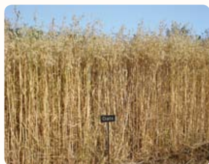
Oats seed crop