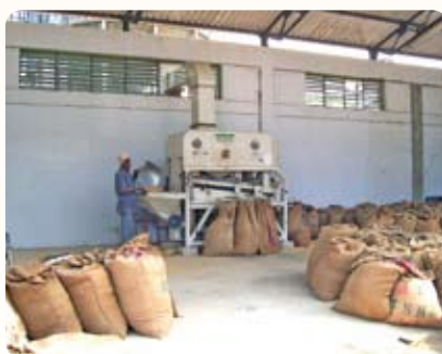
Seed processing unit